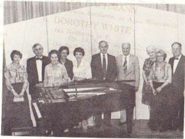
Committee members with the new Grand Piano 17.3.78.